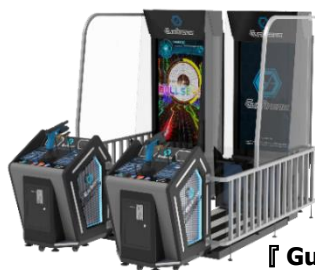
『 GunArena CE』