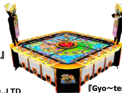
『Gyo~ten! Gappoli sushi KIWAMI』 ©ENHEART

© SANYO BUSSAN CO.,LTD © BANDAI NAMCO Amusement Inc. "SEA STORY" is a registered trademark of SANYO BUSSAN CO.,LTD