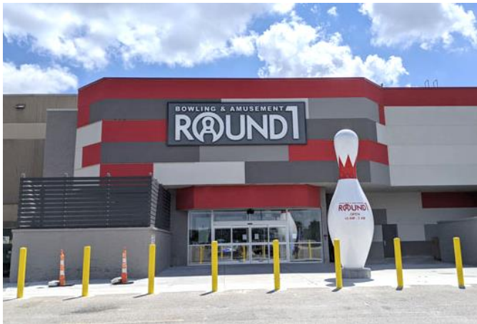
Town East Square ( Wichita, Kansas, USA ) July 18, 2020 Open !