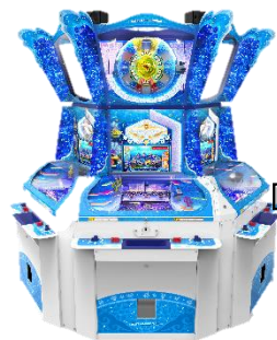
『 SEA STORY Lucky Marine Tours』

© SANYO BUSSAN CO.,LTD © BANDAI NAMCO Amusement Inc. "SEA STORY" is a registered trademark of SANYO BUSSAN CO.,LTD